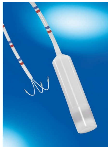
Fig. 1: Shrink-wrapped and welded food tank sensor (hygienic design)

One of the solutions for sealing sensors against air and media is dual heat-shrinkable tubing (Fig.2).